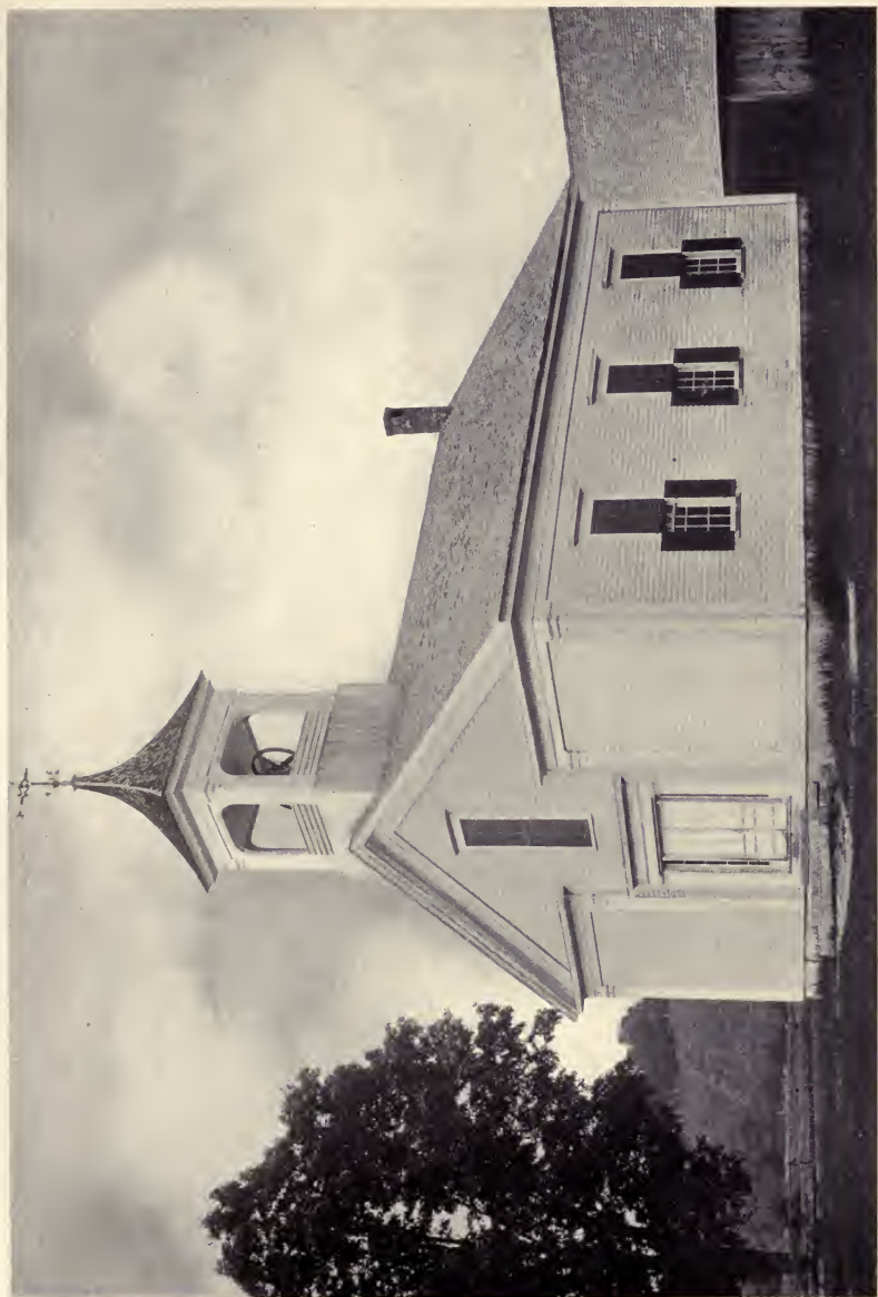
THE CONGREGATIONAL MEETING-HOUSE IN TEMPLE, MAINE